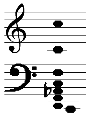
Fig. 1: Subharmonics of an audio signal with pitch C5

It becomes apparent that the subharmonics are equivalent to the tones of the minor chord scale .