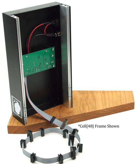
*Cell[48] Frame Shown

Cases should be attached to double row sides so the back of both cases face each other. This keeps the power buttons close to each other and hides the power adapter cables.